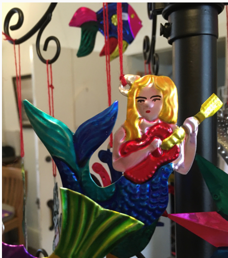
Take home some shiny ornaments from our new Christmas tree.

The Custom House Store is loaded with new merchandise, starting with our centerpiece: a metal "tree" festooned with colorful tin ornaments for sale. We have a fresh assortment of jewelry, too, including Chinese bangle bracelets in cloisonné, jade or porcelain, and French-hook earrings with pearls, sea glass, coral, or starfish and made of either sterling silver or gold vermeil. For men, we now carry inexpensive pocket watches in a variety of embossed designs, in addition to our popular spyglasses, compasses, and other brass collectibles.