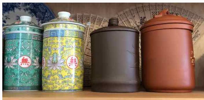
Green or Yellow Porcelain and Yi Xing Clay mugs