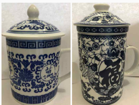
Traditional blue and white porcelain mugs

New clay nativity sets are back in stock, and we have a good inventory of ox-bone scrimshaw boxes in several sizes, plus one horn scrimshaw. Other new merchandise that would make great inexpensive gifts are bottle openers in the shape of a fish or a dolphin, Chinese porcelain chopsticks, and new styles of tea-strainer mugs.