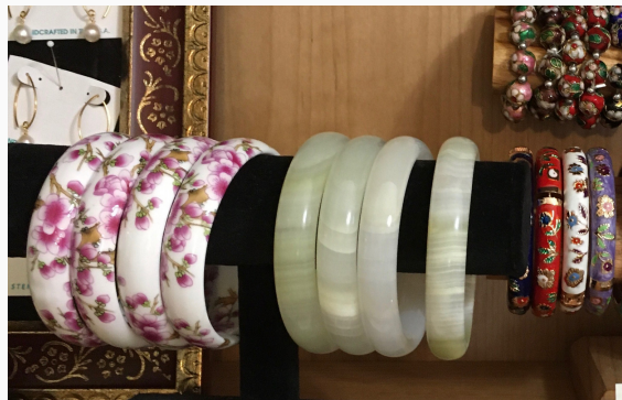
You can never have too many bangles! More bracelets are available this season.