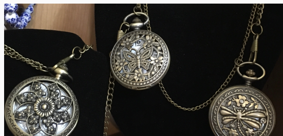
These specialty pocket watches are great for everyone, and at $12.50 they're easy on the pocketbook.