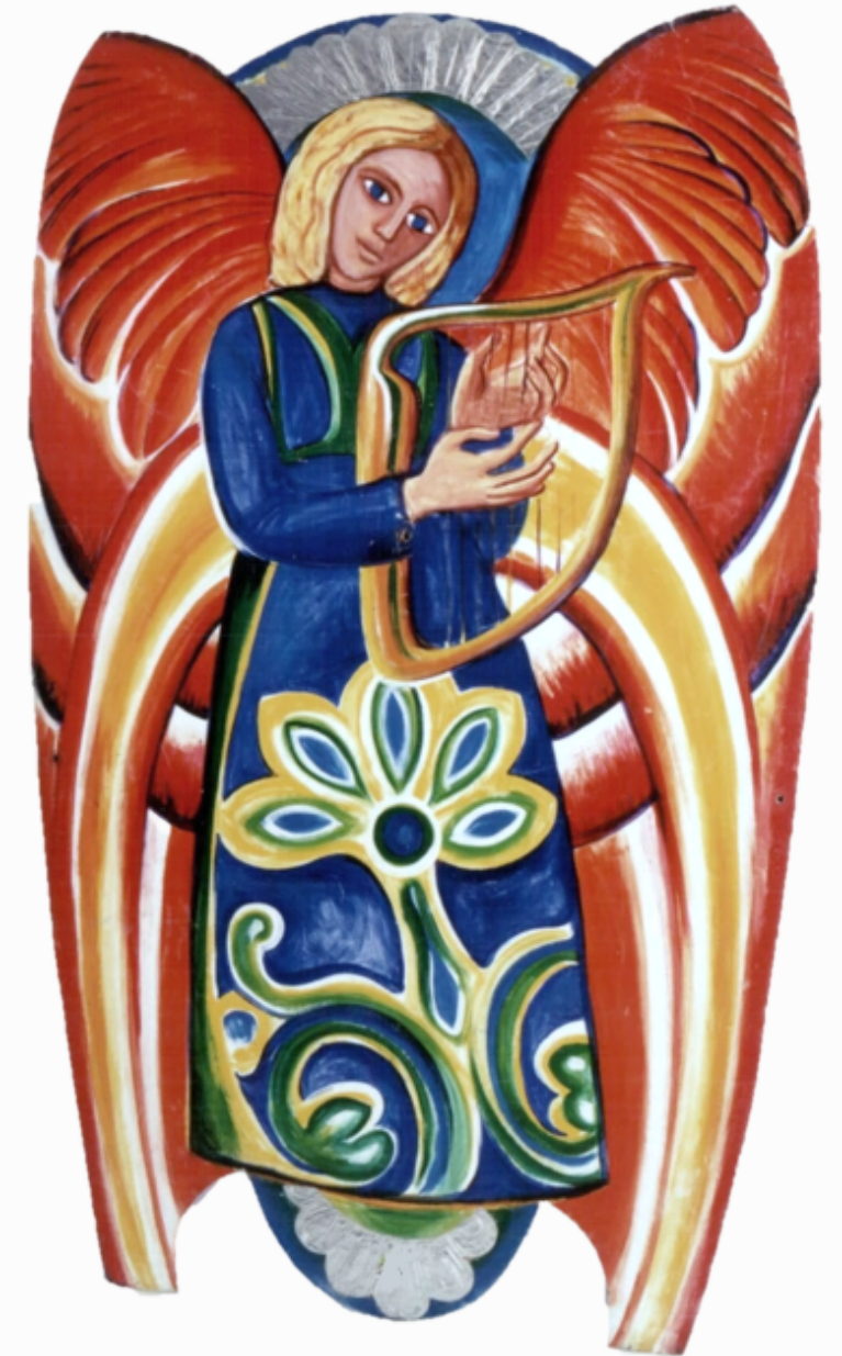
Angel image courtesy of City of Monterey Erica Franke 1957